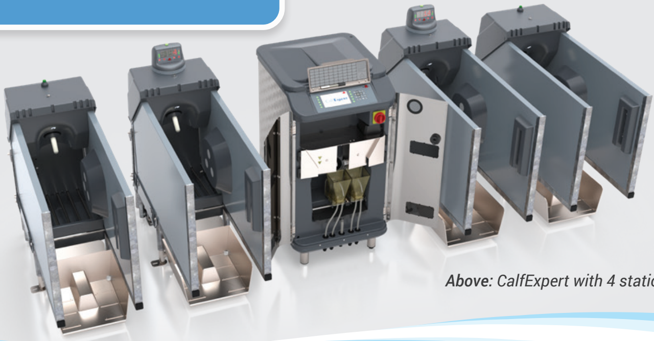
Above: CalfExpert with 4 stations