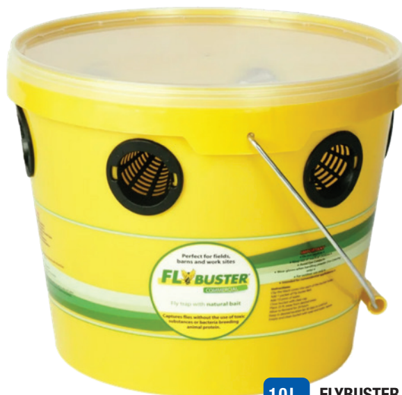
10L FLYBUSTER TRAP