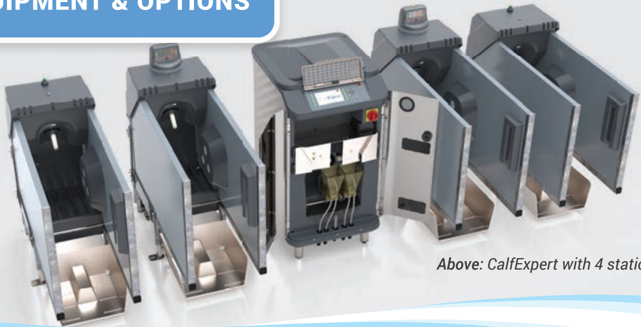
Above: CalfExpert with 4 stations