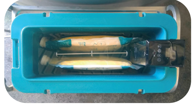
Thaw 2 x 4-litre colostrum bags in 20 minutes