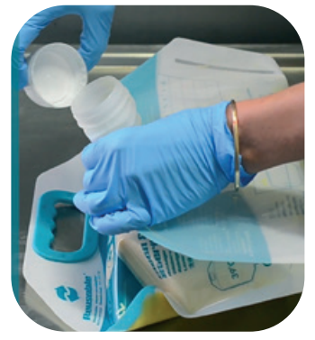
Squeeze the air out of the bag after filling with colostrum.