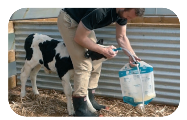
Feeding colostrum within the first hour of birth is best practice to achieve maximum Passive Immunity Transfer.

Wait at least one second after all liquid has finished running through, then gently remove.