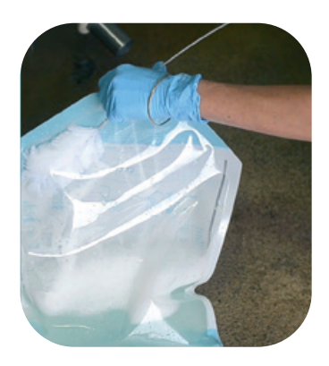
Cleaning - use a brush and scrub thoroughly with warm water and detergent, before rinsing thoroughly.