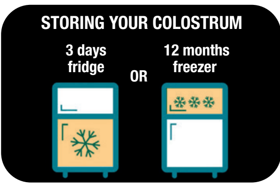
Chilling colostrum ASAP is very important to prevent bacterial growth and preserve antibodies.