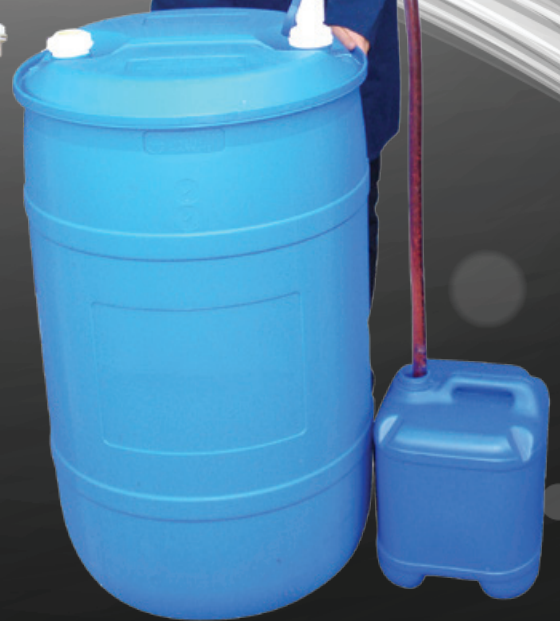
Ezi-action 25/5 DRUMPUMP