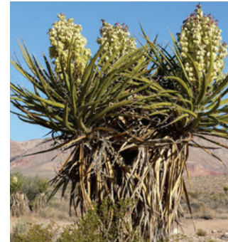
Yucca plant extract has been used in US cattle production for more than three decades.