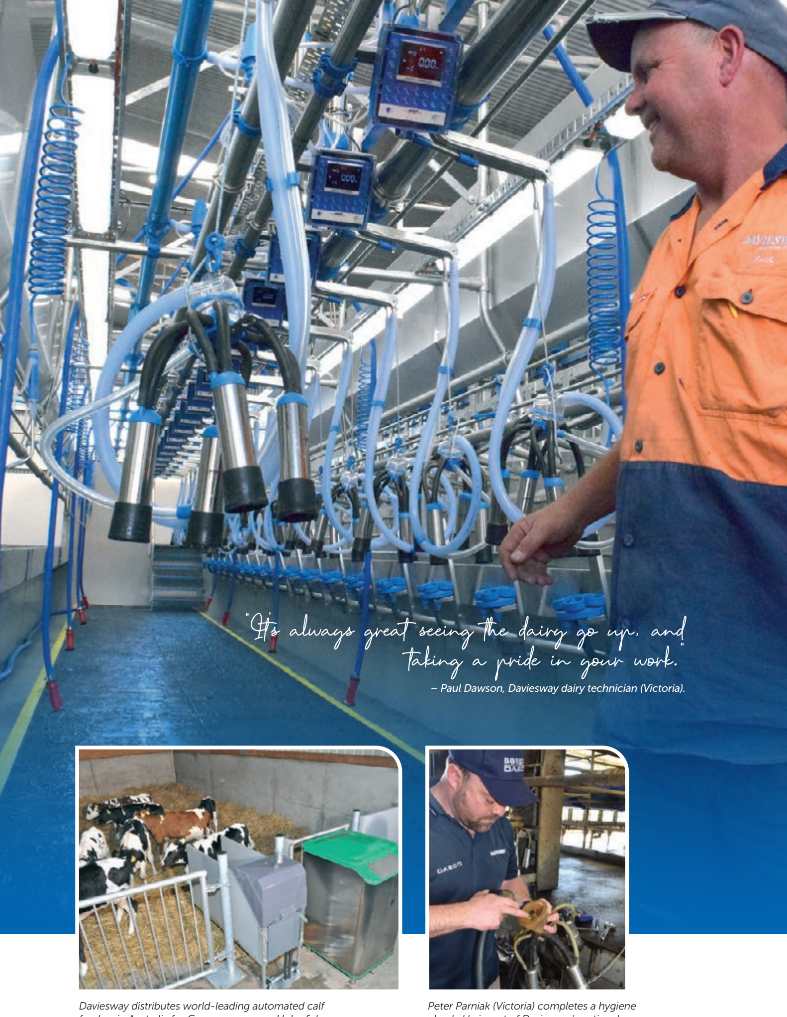
feeders in Australia for German company Holm & Laue.