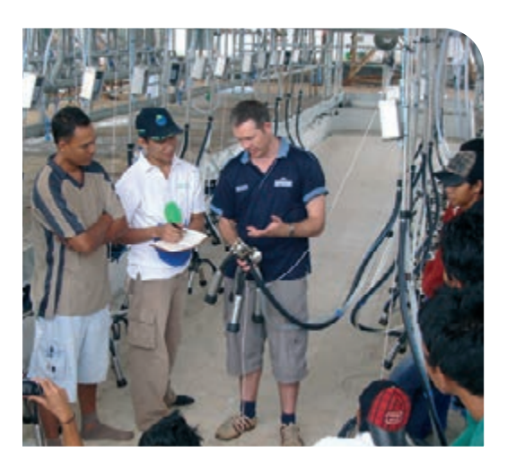
When your dairy is complete, Daviesway will be there for support and training.