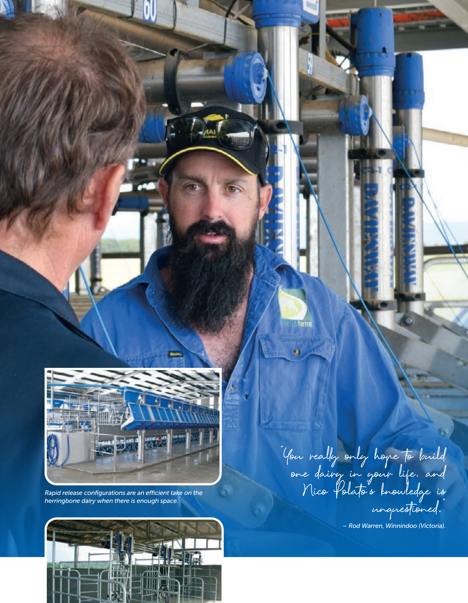
A FLO-TEK line milking machine, which Daviesway installed in Indonesia.