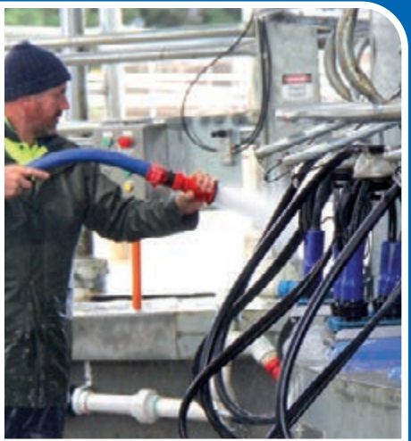
New Zealand's Skellerup Master Blaster hose uses up to 30% less water, and delivers 450 litres/minute.