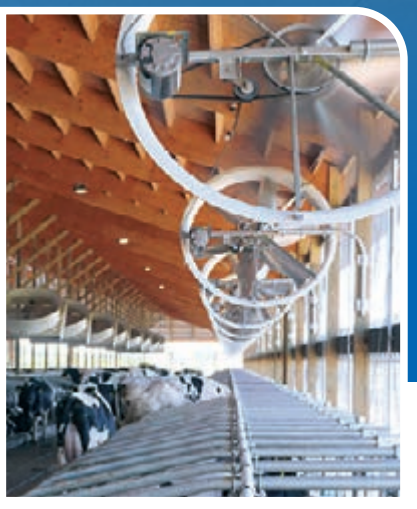
Daviesway distributes VES-Artex Barn Solutions in Australia because the US-based company has unmatched knowledge in cow cooling conversations.