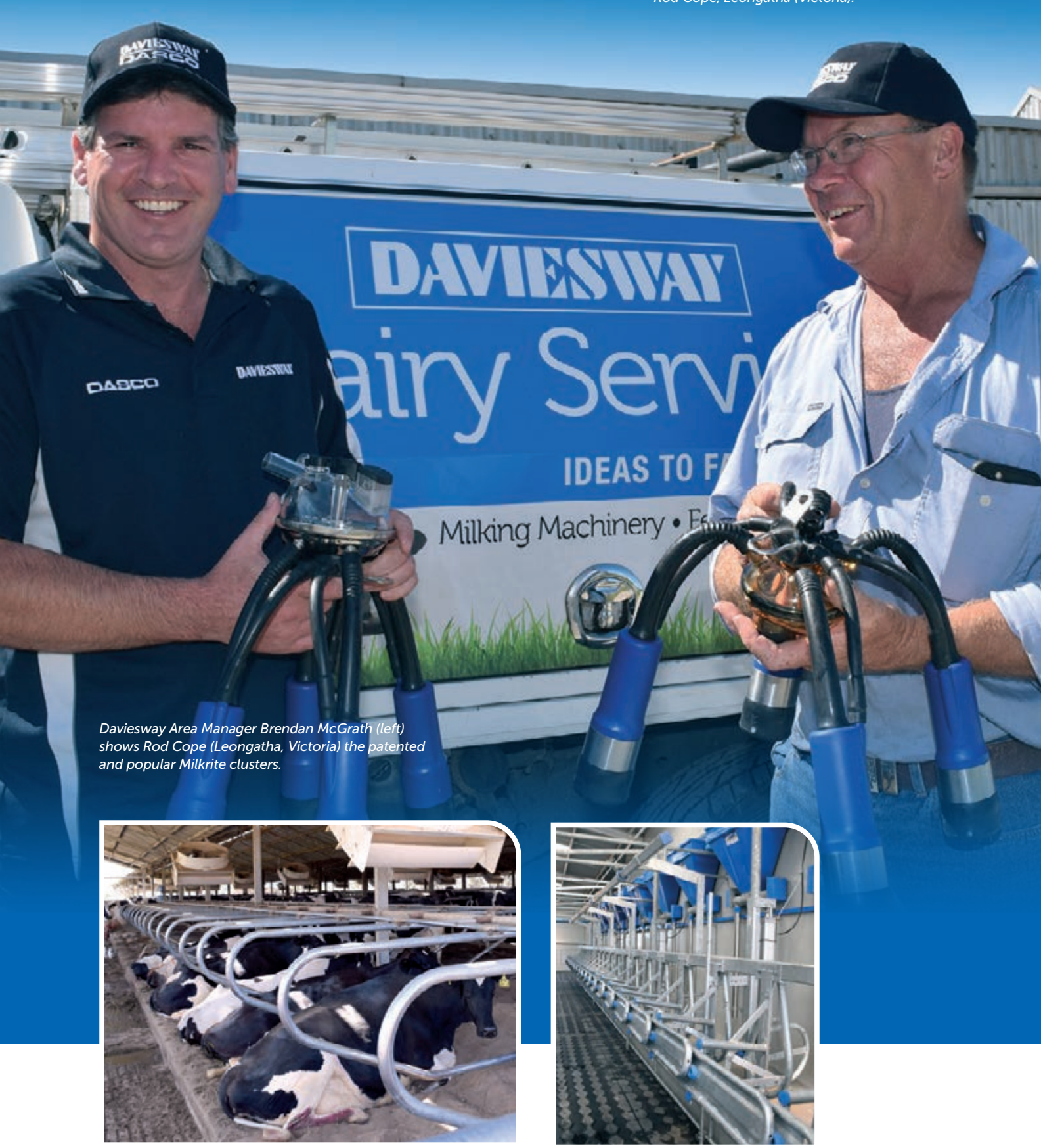
Tailoring cow comfort solutions draws on best-practice from US-based VES-Artex Barn Solutions.