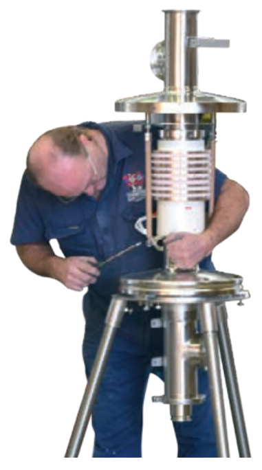
Daviesway builds and exports rotary glands worldwide from its Warragul fabrication branch in Victoria.