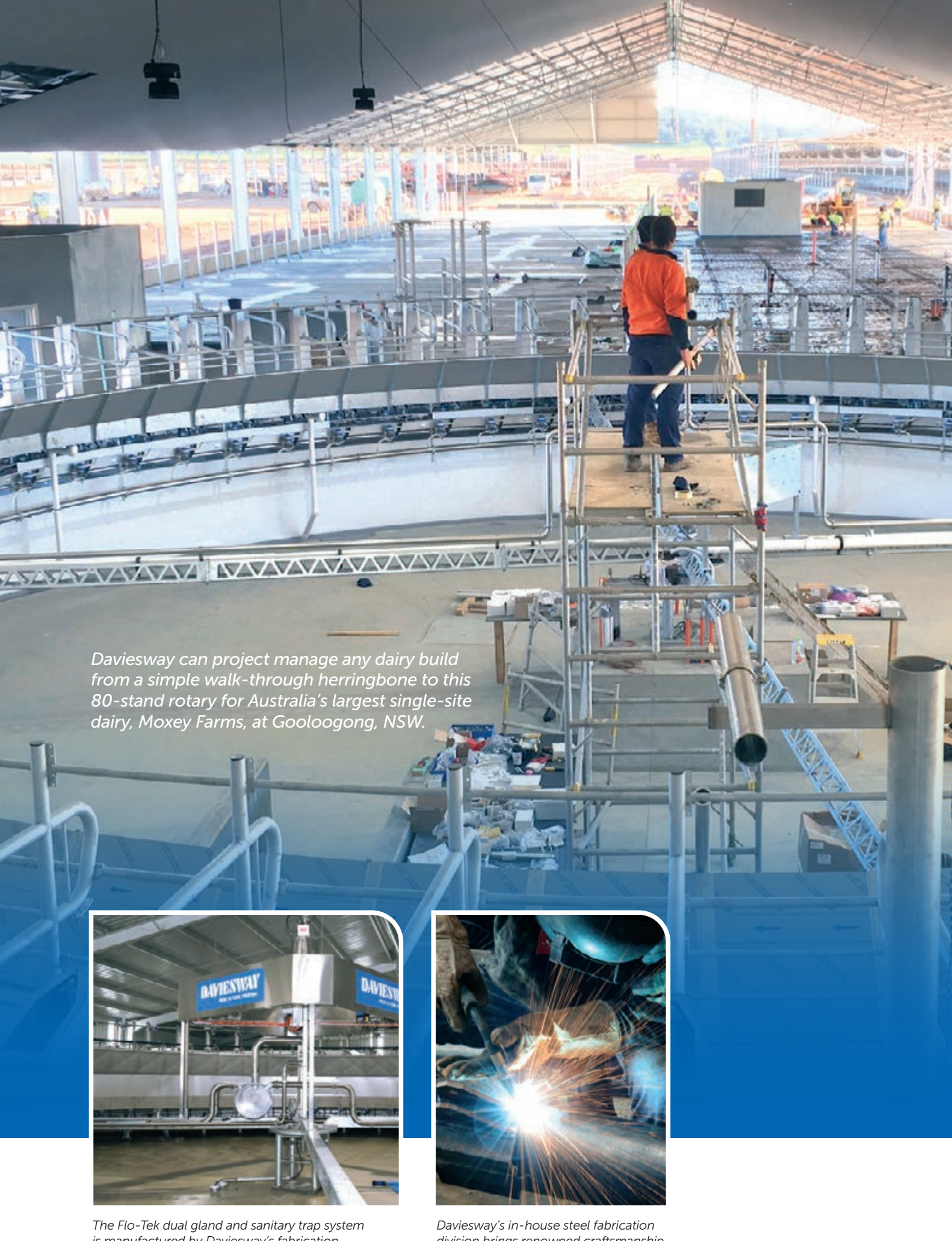
The Flo-Tek dual gland and sanitary trap system is manufactured by Daviesway's fabrication division at Warragul, Victoria.