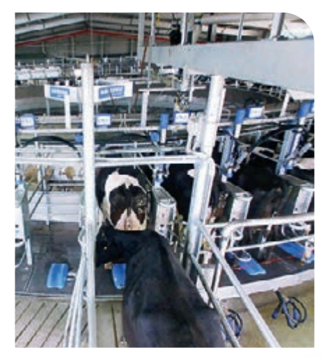
A cool, calm, and inviting environment for the cows as they step onto the platform means they are dealing with natural oxytocin rather than adrenalin.