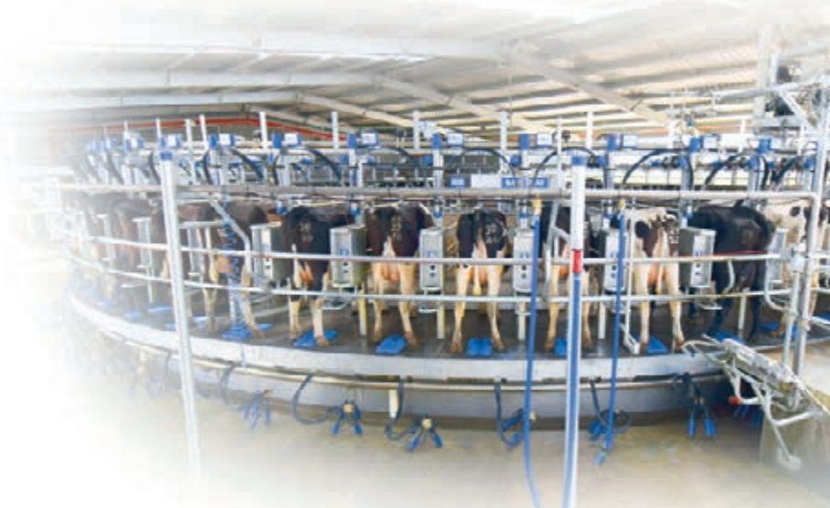
Rotary dairy - 60 units