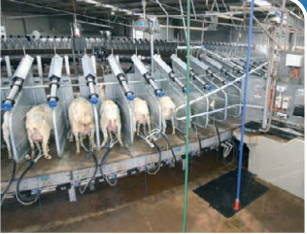
Daviesway successfully took on a technical project when it converted a 60-stand dairy cow rotary into a 120-stand goat dairy capable of milking 8000 goats in South-Western Victoria.