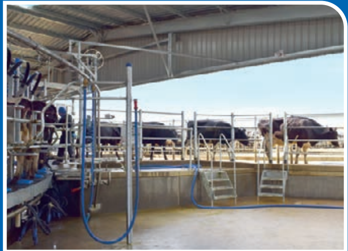
A calm milking environment matched with a stress-free exit makes milking a pleasure not a chore.