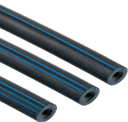
Blue line rubber milk tube

All Skellerup rubberware that contacts with milk complies with REACH, BfR and FDA standards.