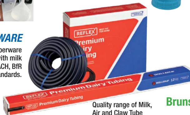
Quality range of Milk, Air and Claw Tube