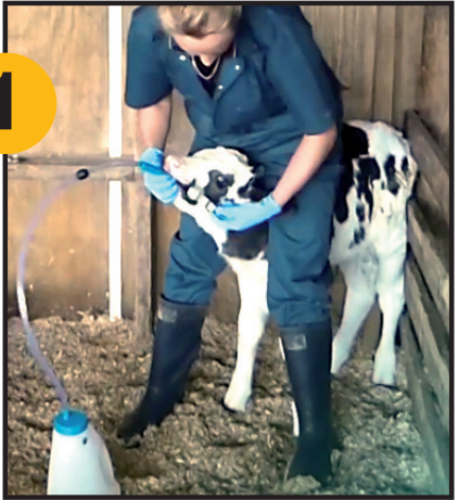
Mouthpiece crossbar sits comfortably in the corner of the calf's mouth. The strap is placed behind ears – fasten so mouthpiece sits snug in the mouth.

NUMBER ONE RULE: Never let fluid flow unless the tube is safely in the oesophagus.