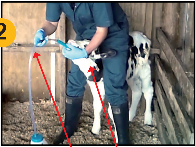
Pass the flexible tube through the mouthpiece so tube enters the oesophagus.