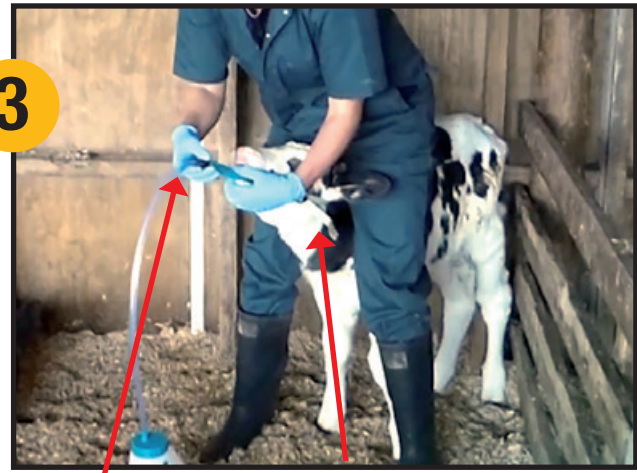
Stopper and calf size guides for easy positioning.