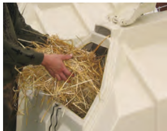
Full Open Bedding Door