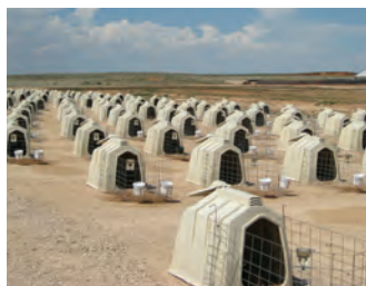
Compact and Economical