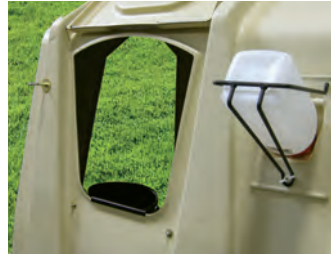
Inside feeding stations keep feed and calves dry. (Shown with optional bottle holder)