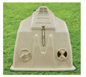
Optional supplemental air vents