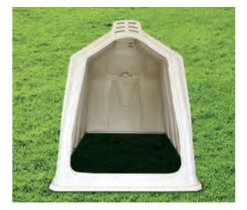
Also available with a Full Open entry