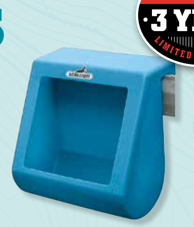
PMF 510H x 400W x 500L / Capacity 12kg