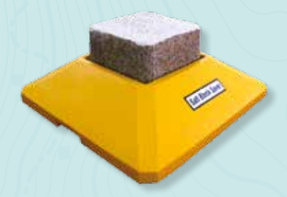
SALT BLOCK SAVER 555W x 555L x 140H