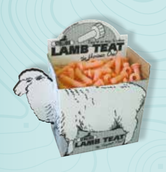
LT Stallion Lamb Teats for bottles or any MM or FC feeder.