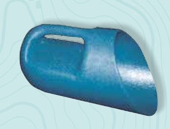
SC Poly Scoop with a capacity of 2kg 160H x 160W x 300L