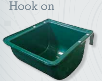
PF10 230H x 335W x410L/10 litre