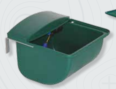
PT10 310H x 340W x 400L / 10 litre PT30 300H x 410W x 880L / 30 litre