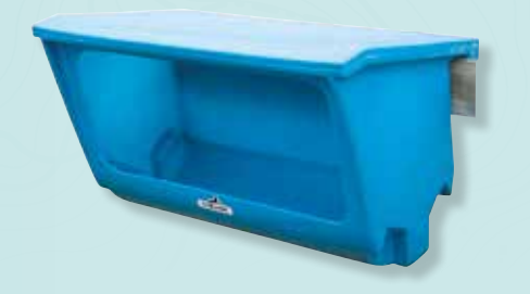
CMF 580H x 670W x 1060L / Capacity 40kg