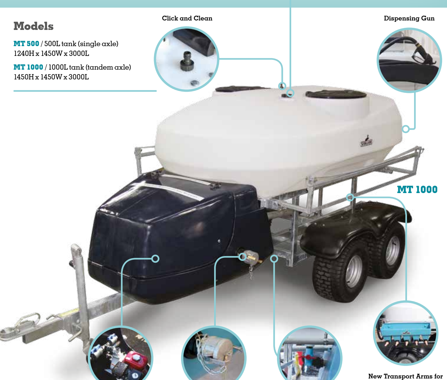
Honda 4 Stroke Pump