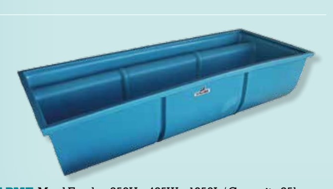
LPMF Meal Feeder 250H \times 425W \times 1050L / Capacity 25kg