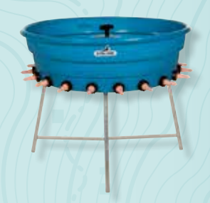
FC20 940H x 1120 diameter 160 litre / 20 teat