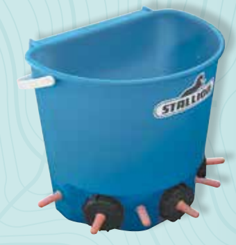
BKTL 10 litre /7 teat / bracket suitable for wood or wire fences 280H x 240W x 320L