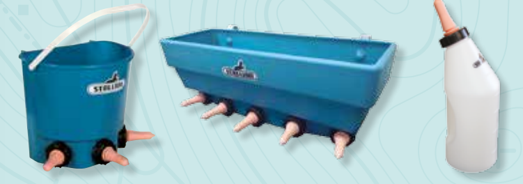
BKT 280H x 240W x 320L / 10 litre / 3 teat