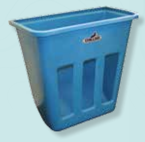
HAYPEN 630 H \times 350 W \times 650 L / 60 litre